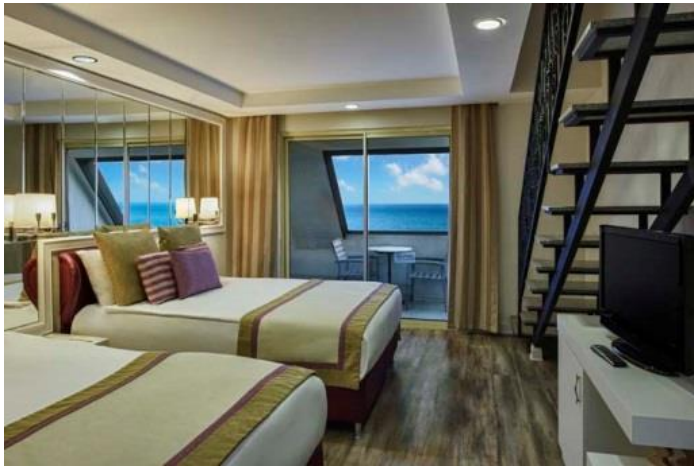
Duplex Family Room downstairs

Technical hotel details for disabled guests (26 m 2 ): the rooms have the same furnishing as a Standard room. Specially installed shower and toilet. Emergency button available. Located on the entrance floor. Technical details, Door: 93cm, Balcony door: 60 cm, Lift's door: 90 cm, Bathroom door: 93 cm, Washbasin height: 81 cm, WC height: 50 cm (Accommodation: 2 adults). The reception, restaurants, swimming pools and the beach are accessible with a wheelchair.