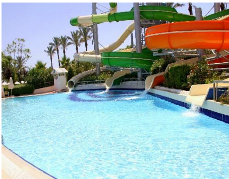
Pool with Water Slides