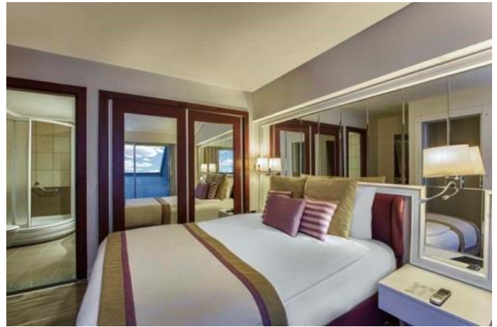
Duplex Family Room upstairs

Duplex Family Rooms (47 m 2 ): 2 bedrooms, (1 st floor: 1 french bed + 1 single bed with a shower), (2 nd floor 1 french bed with a shower) and 1 WC. The Duplex Family Room include a hair dryer, telephone, TV, mini bar, safe, laminate flooring, air conditioning (central heating + between hours), water boiler, tea and coffee. Everyday: room cleaning, change of towels. Once Every 2 days: change of bed linen. Balcony. (Accommodation: 3 adults + 2 children or 4 adults + 1 children)).