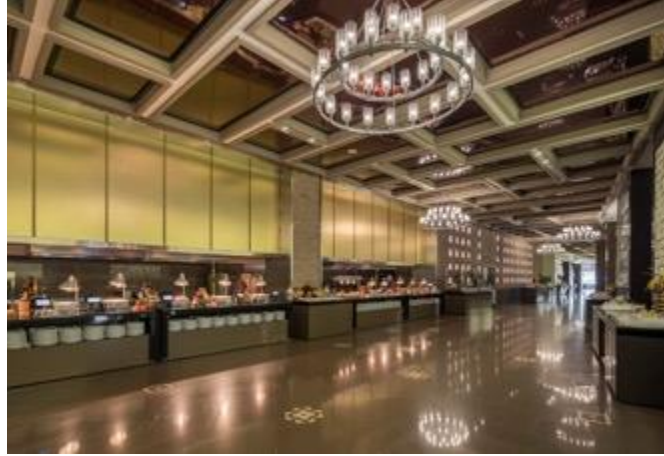
Turquoise Main Restaurant (All Day Dining)