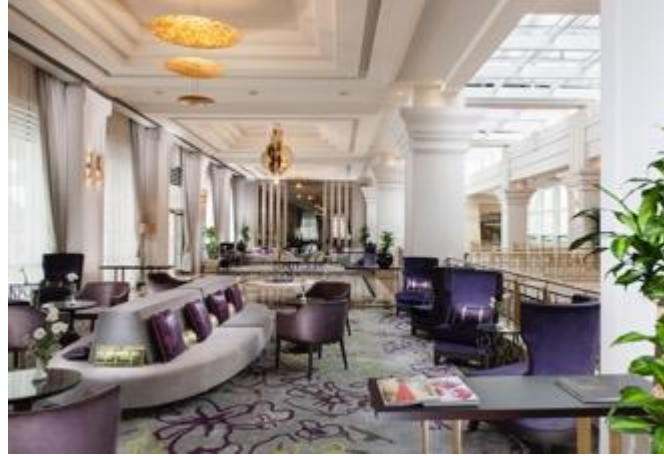
Fresh Fruit Juice for breakfast at the Turquoise Restaurant (Main)