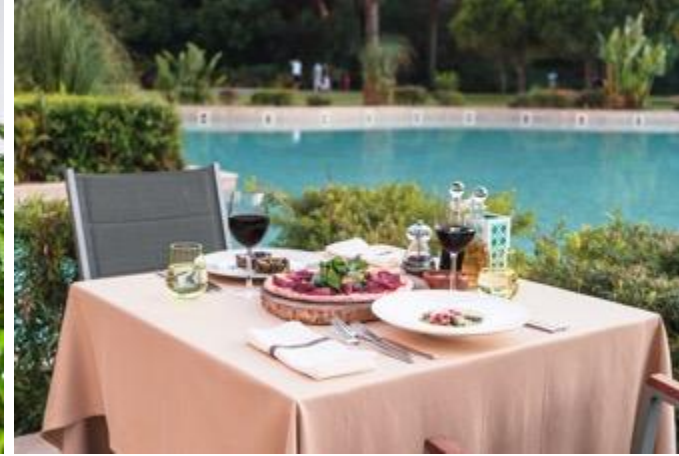
Rixy Restaurant (Outdoor Rixy Kids Club) Kids Corner (Main Restaurant)